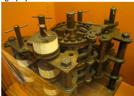
Figure 2. Parts of the original Babbage's machine.